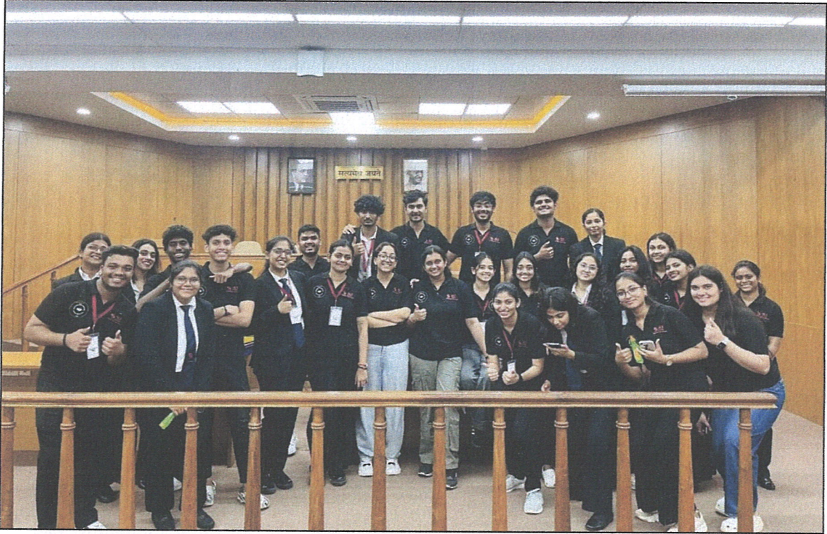
The Team of ADRC

Constituent of Symbiosis International (DEEMED UNIVERSITY), Pune Re-accredited by NAAC with "A++" Grade- Awarded Category – I by UGC