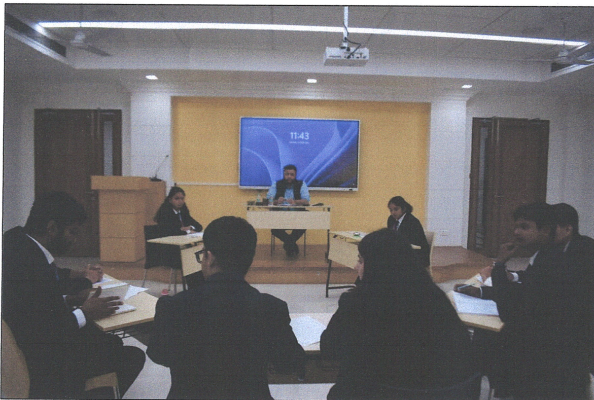
Glimpses from conference rooms.